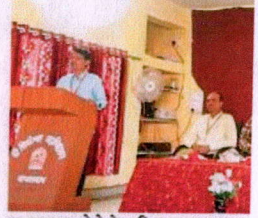
माजलगाव येथे केम क्विझच्या उद्घाट

कूलने यात्रेत केले ग संत वतीने हमाग थ्यांना उमारे, येथील श्री सिध्देश्वर महाविद्यालयात रसायनशास्त्र विभागाच्या वतीने आयोजित 'केम क्विझ - २०१८' स्पर्धा उत्साहात पार पडली. या स्पर्धेत तालुक्यातील विविध महाविद्यालयांनी सहभाग नोंदवला. विद्यार्थ्यांमध्ये