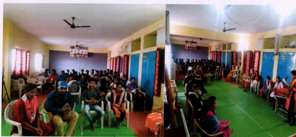
Chem Quiz - 2019